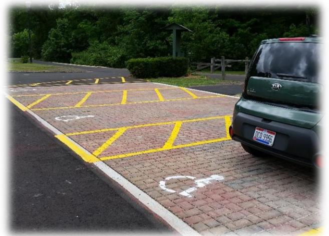
Permeable pavement reduces ice-build up and acts as a safety feature for handicapped parking stalls.