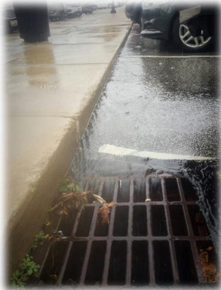
Stormwater typically flows untreated to our lakes, rivers, and streams.

The City of Mentor, through an Ohio EPA Surface Water Improvement Fund grant, retrofitted the Wildwood parking lot to include permeable pavement and a bioretention system. This green infrastructure mimics natural landscapes by infiltrating stormwater into the ground, filtering out pollutants, cooling it down, and reducing the amount of runoff entering the storm drainage system.