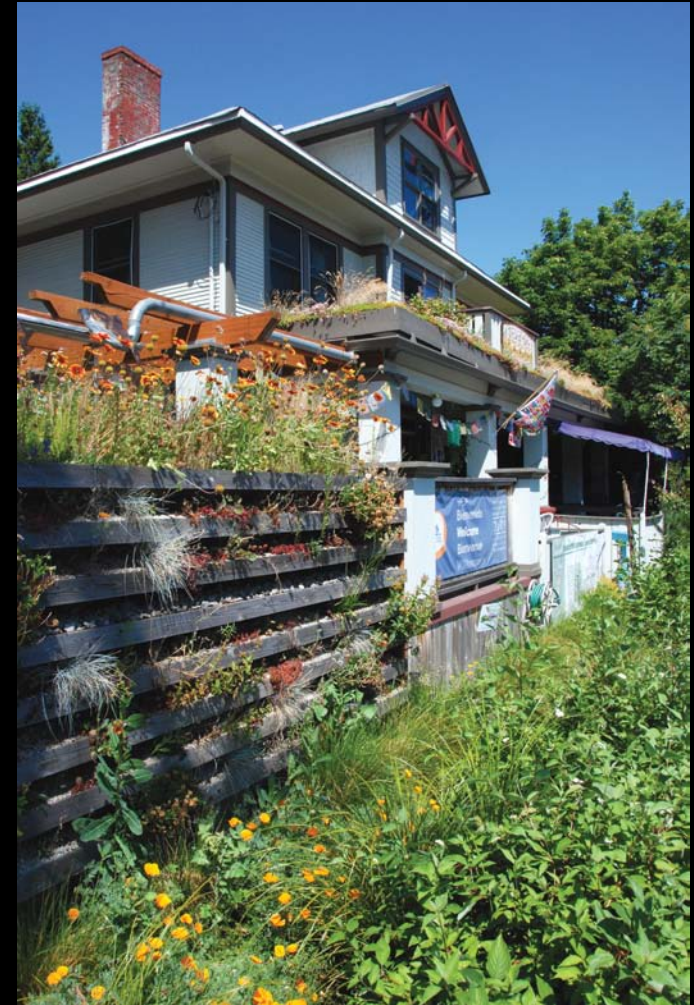
Youth Hostel Portland, OR