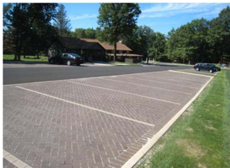
Permeable pavement at Centerville Mills Park installed in 2016.