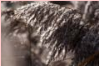
COMMON REED GRASS Phragmites australis