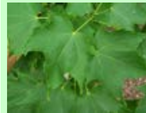
SUGAR MAPLE Acer saccharum