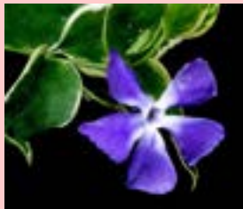
PERIWINKLE Vinca major