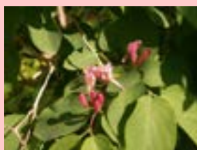
ASIAN BUSH HONEYSUCKLES Lonicera spp.