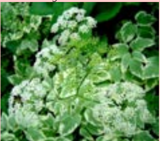
GOUTWEED Aegopodium podagraria