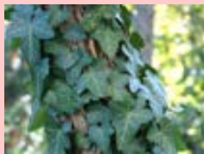
ENGLISH IVY Hedera helix