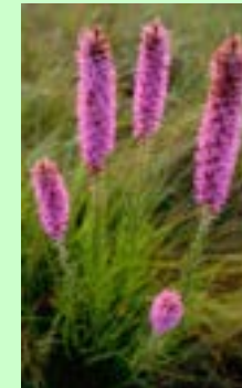
PRAIRIE BLAZINGSTAR Liatris spicata