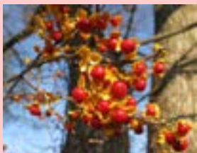
ORIENTAL BITTERSWEET Celastrus orbiculatis