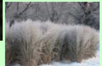
PRAIRIE DROPSEED Sporobolus heterolepis