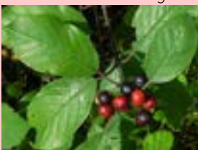
GLOSSY AND COMMON BUCKTHORN Frangula alnus Rhamnus cathartica