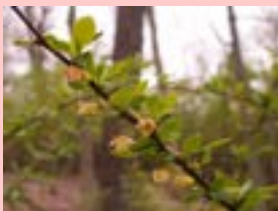
JAPANESE BARBERRY Berberis thunbergii