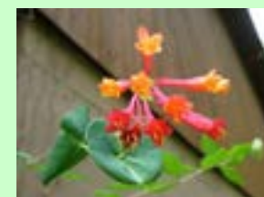
SCARLET HONEYSUCKLE Lonicera sempervirens