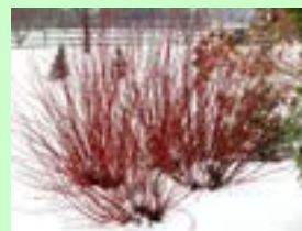
RED-OSIER DOGWOOD Cornus sericea