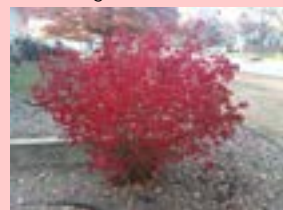
BURNING BUSH Euonymus alatus