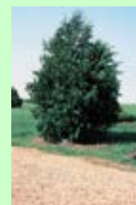
AMERICAN ARBORVITAE Thuja occidentalis