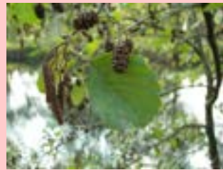
EUROPEAN ALDER Alnus glutinosa