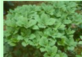
ALLEGHENY PACHYSANDRA Pachysandra procumbens