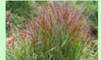
SWITCHGRASS Panicum virgatum