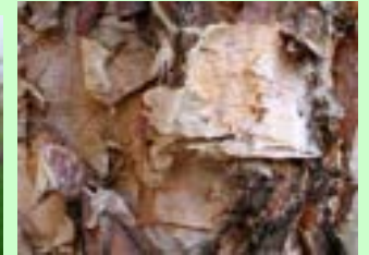
RIVER BIRCH Betula nigra