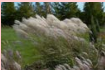
MAIDEN GRASS Miscanthus sinensis