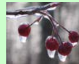
RED CHOKEBERRY Aronia arbutifolia