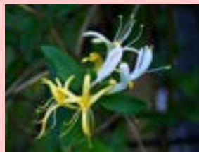
JAPANESE HONEYSUCKLE Lonicera japonica