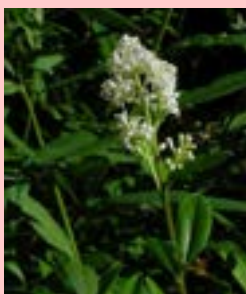
COMMON PRIVET Ligustrum vulgare