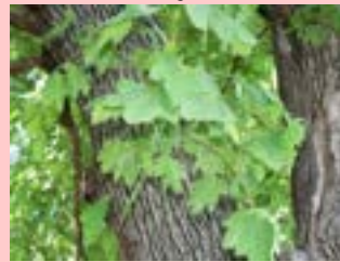
NORWAY MAPLE Acer platanoides