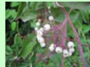
GREY DOGWOOD Cornus racemosa