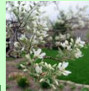
SERVICEBERRY Amelanchier spp.