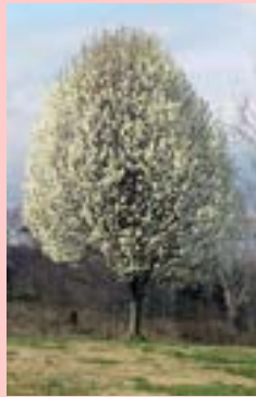
CALLERY PEAR Pyrus calleryana