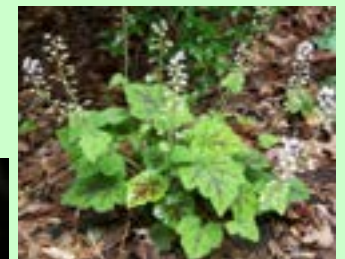
FOAMFLOWER Tiarella cordifolia