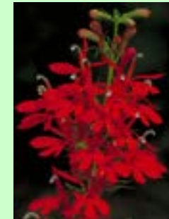
CARDINAL FLOWER Lobelia cardinalis