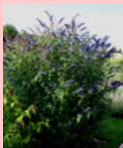
BUTTERFLY BUSH Buddleja davidii