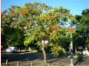
TREE OF HEAVEN Ailanthus altissima