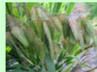
INLAND SEA OATS Chasmanthium latifolium