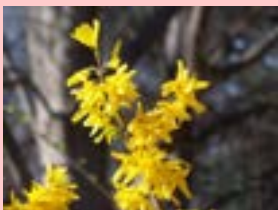
FORSYTHIA Forsythia intermedia