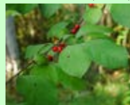
SPICEBUSH Lindera benzoin