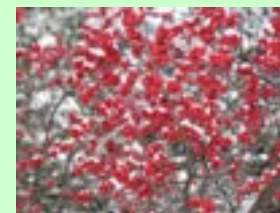
WINTERBERRY Ilex verticillata