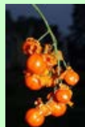
AMERICAN BITTERSWEET Celastrus scandens