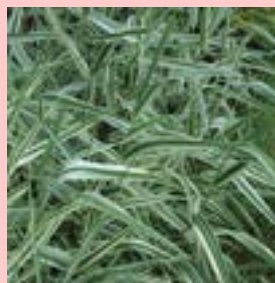
REED CANARY GRASS Phalaris arundinacea