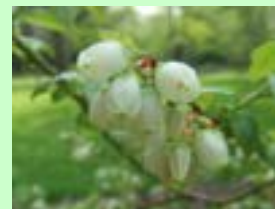
HIGH-BUSH BLUEBERRY Vaccinium corymbosum