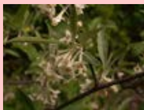
AUTUMN/RUSSIAN OLIVE Elaeagnus umbellata