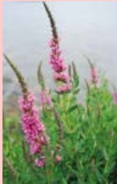
PURPLE LOOSESTRIFE Lythrum salicaria