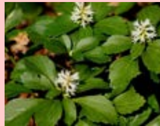
JAPANESE PACHYSANDRA Pachysandra terminalis