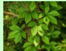
VIRGINIA CREEPER Parthenocissus quinquefolia