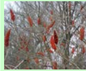
STAGHORN SUMAC Rhus typhina